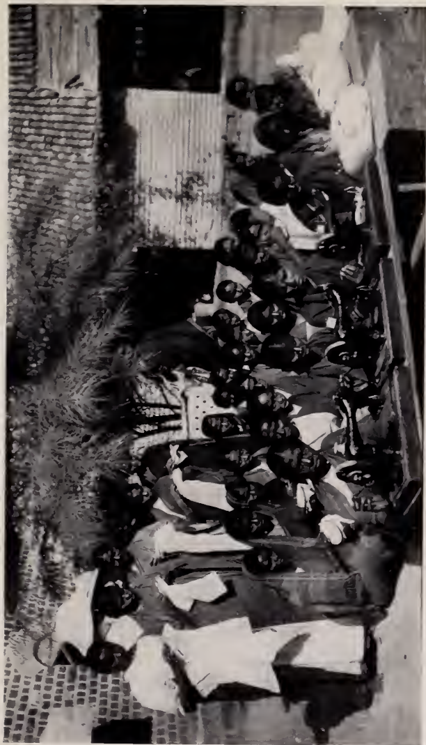
At a mission school in India